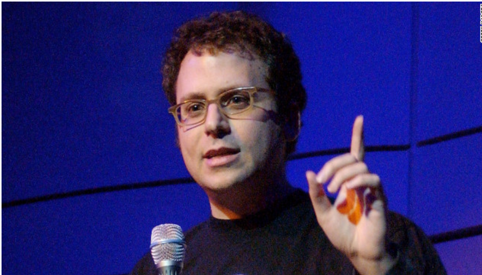
Stephen Glass, who faked dozens of magazine articles, lacks the moral character to be a lawyer, a court says.