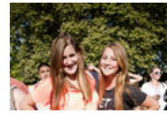
Bumpershoot Day 1