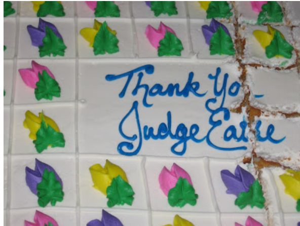
You have to be fast to get to the cake