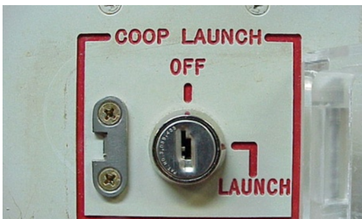
The launch key mechanism at the deactivated Delta Nine Launch Facility near Wall, South Dakota.

Failings exposed last spring at a US nuclear missile base, reflecting what one officer called "rot" in the ranks, were worse than originally reported , according