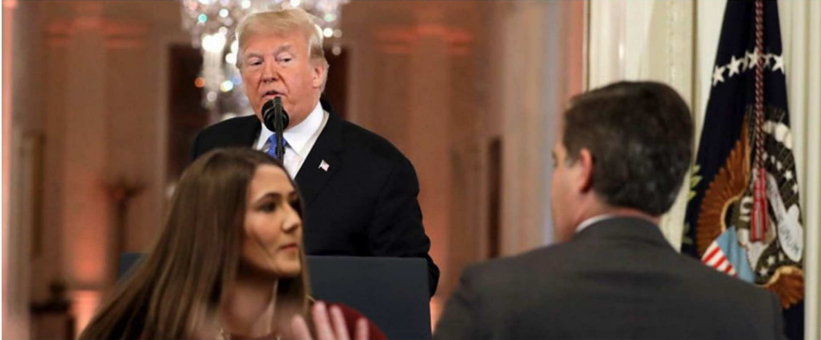
A White House aide takes the microphone from CNN's Jim Acosta, during a news conference in the East Room of the White House, Wednesday, Nov. 7, 2018. A doctored video of this incident has gone around.